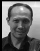
Indonesia Poetra Abadi Regional Manager