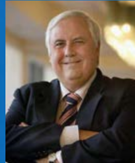
Professor Clive Palmer Chairman of Queensland Nickel

I'm proud of the capable and committed people in the Queensland Nickel Group of Companies who continue to strive to develop and grow the business. We are well positioned to embrace further development opportunities.